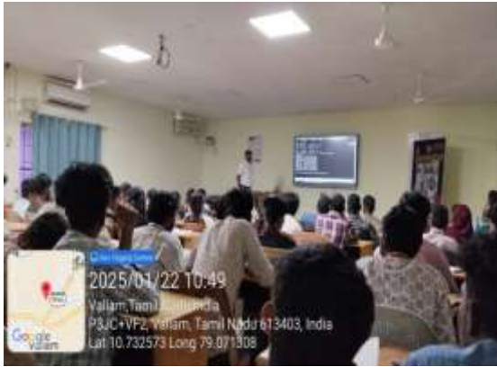
Day 3: 22-01-2025