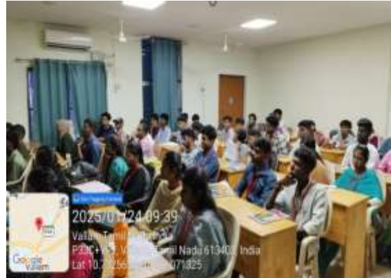
Day 5: 24-01-2025