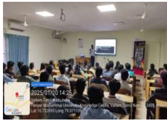
Day 1: 20-01-2025