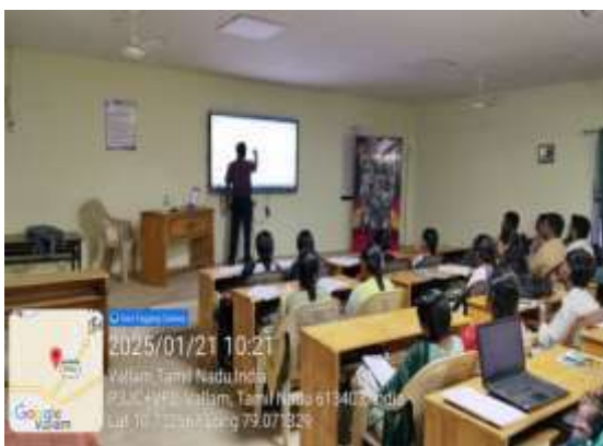
Day 2: 21-01-2025