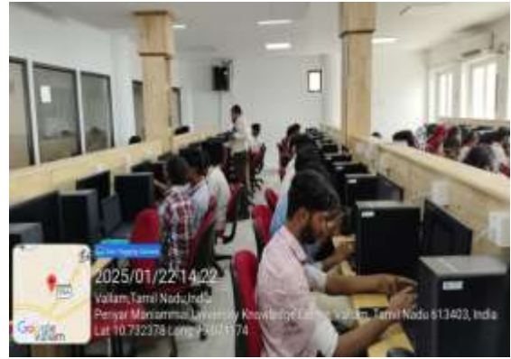
Day 3: 22-01-2025