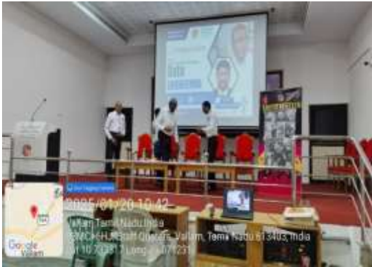
Day 1: 20-01-2025