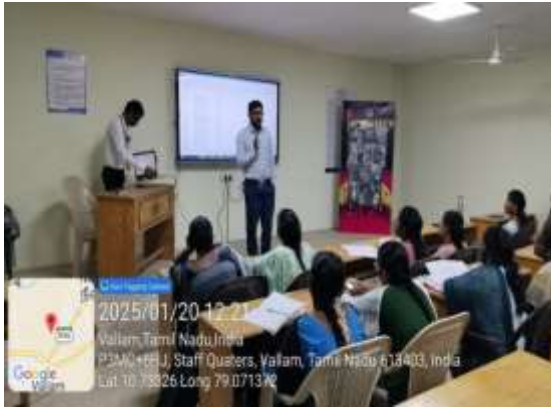
Day 1: 20-01-2025