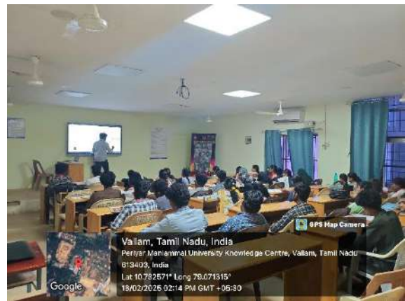
Day 2: 18-02-2025