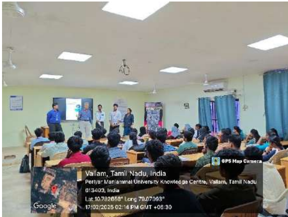
Day 1: 17-02-2025