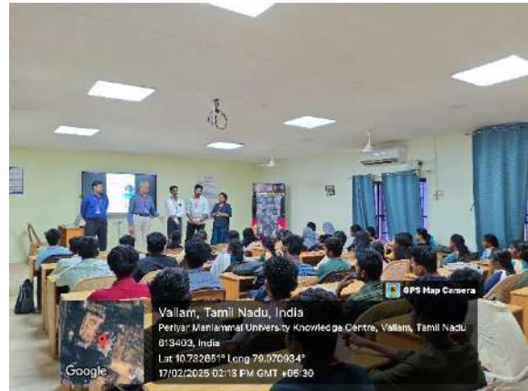
Day 1: 17-02-2025