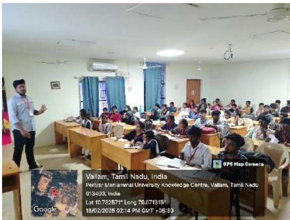
Day 2: 18-02-2025