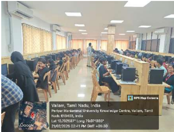
Day 5: 21-02-2025