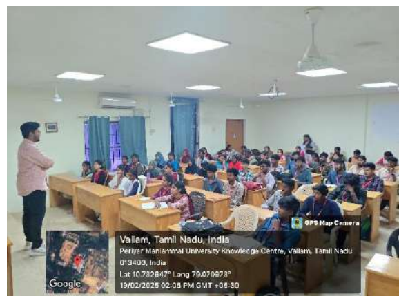
Day 3: 19-02-2025