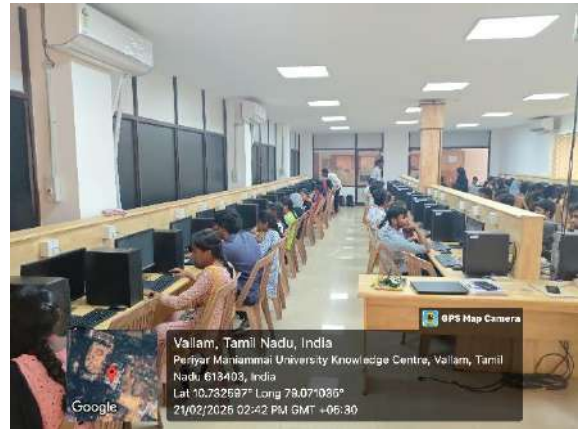
Day 5: 21-02-2025