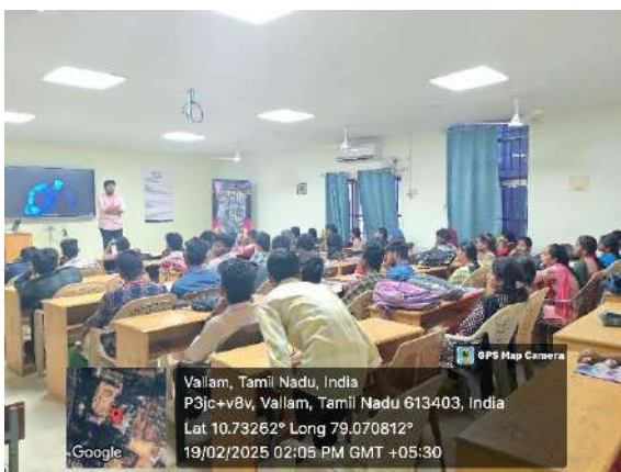
Day 3: 19-02-2025