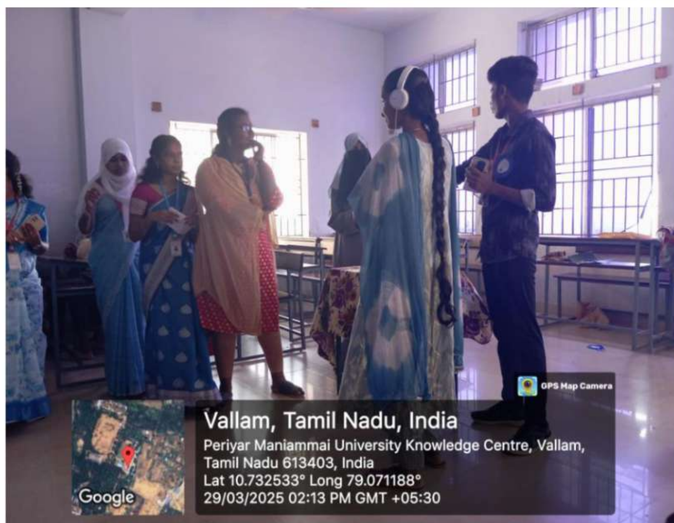
Non-Technical Session – Murmer Mystery