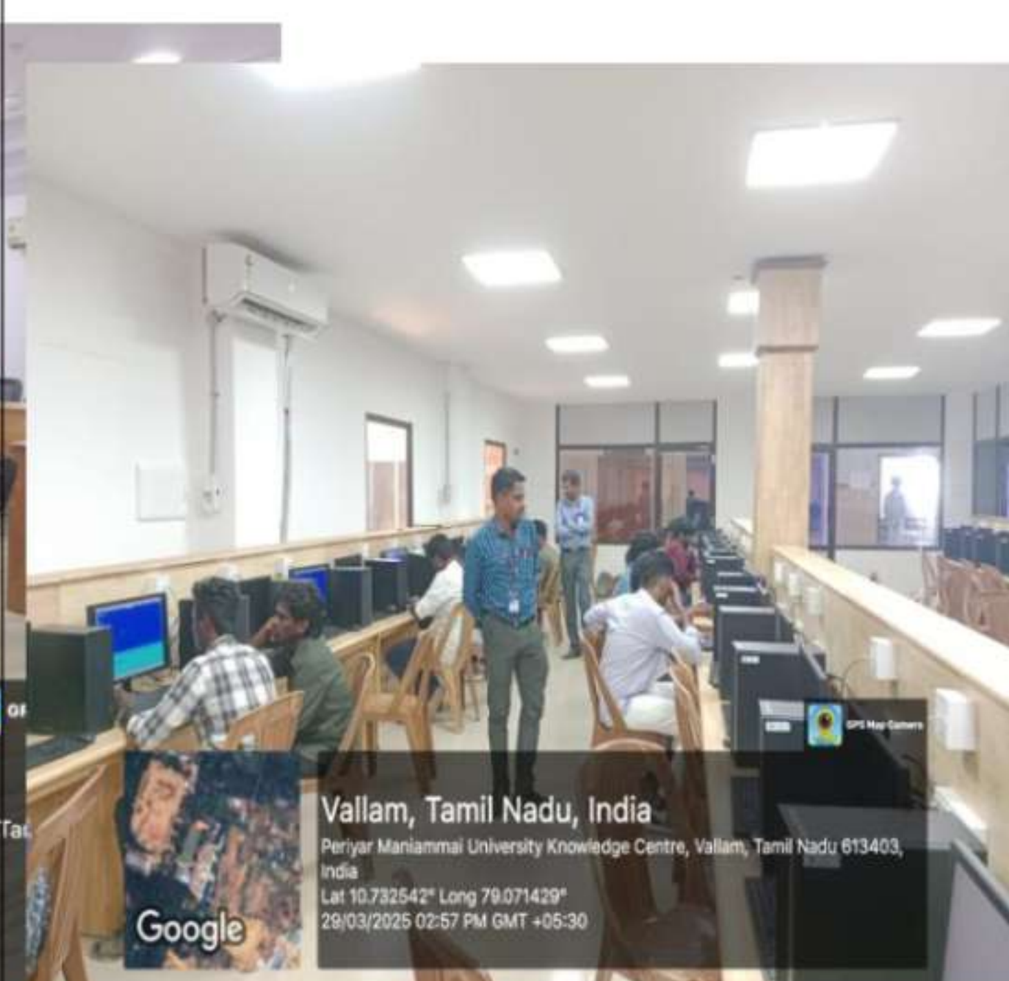
Technical Session – Debugging