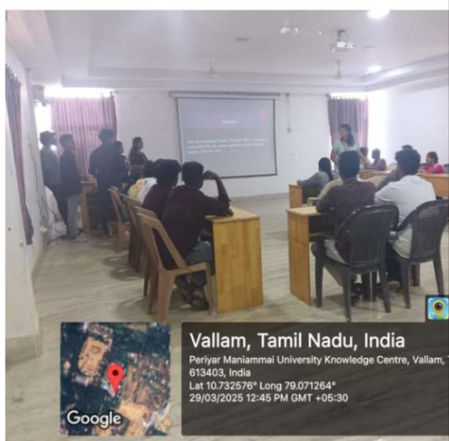
Technical Session - Quiz