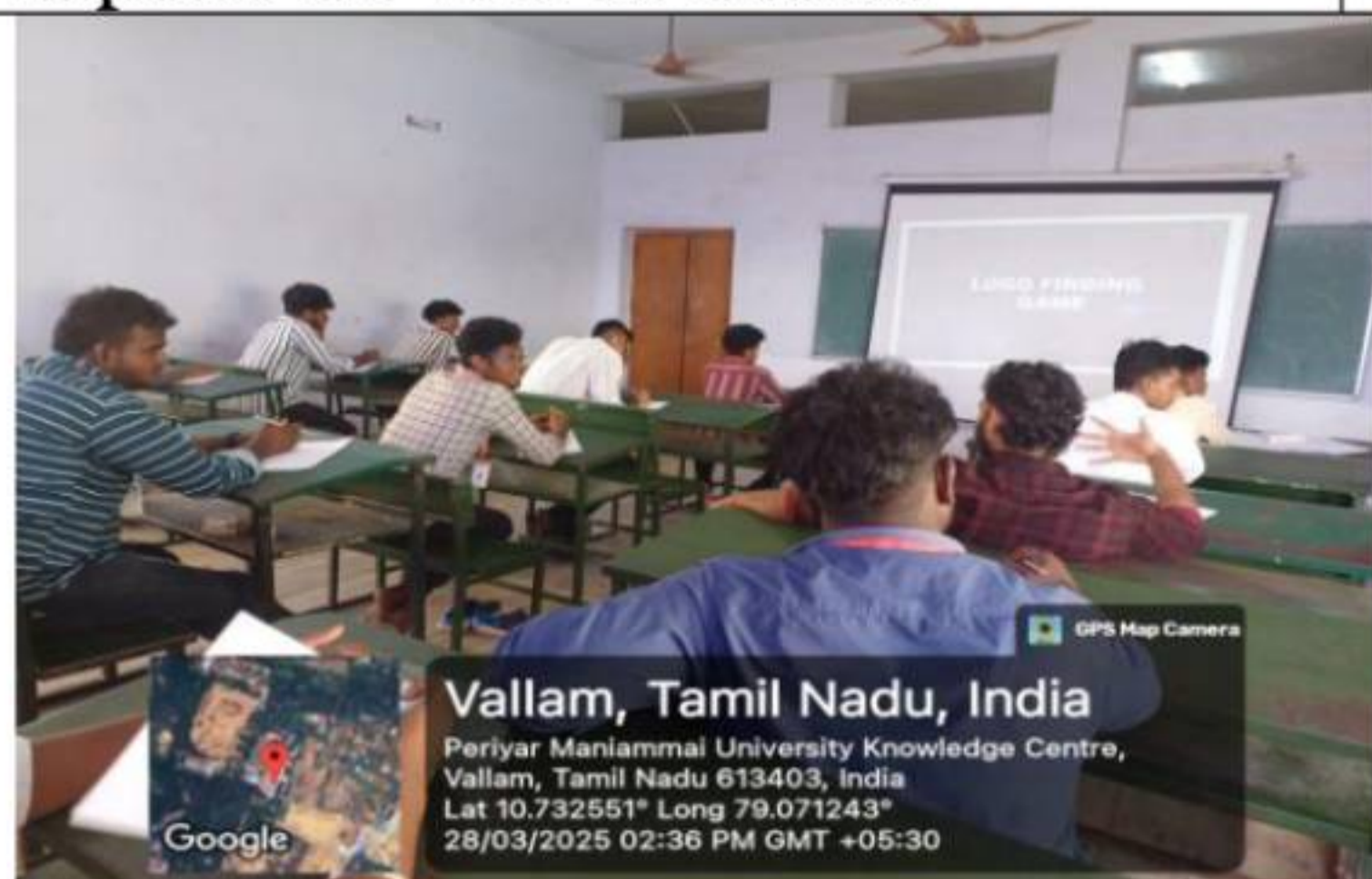
Students participated in logo finding game at intra cultural events – 2k25