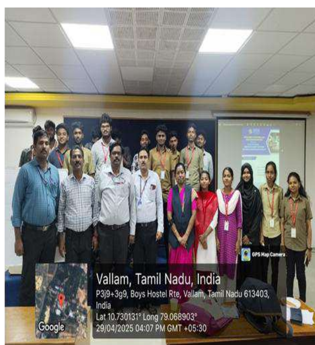
Group photo with the Speaker, staff and students after the lecture