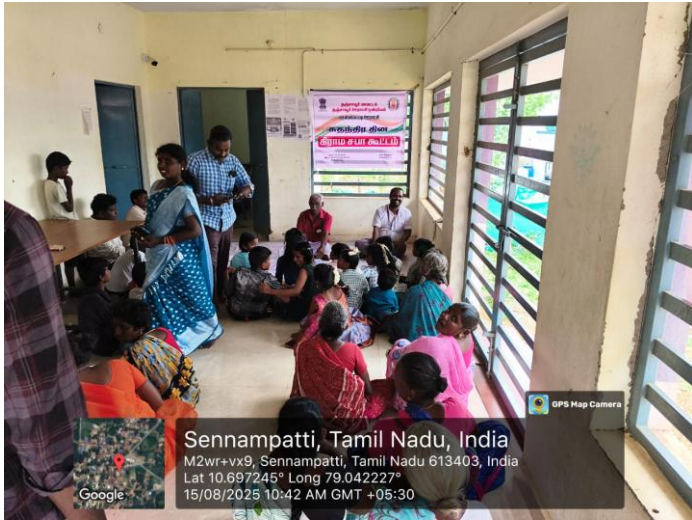
Village people discussed various issues with the Panchayat Board members during the Grama Sabha meeting.