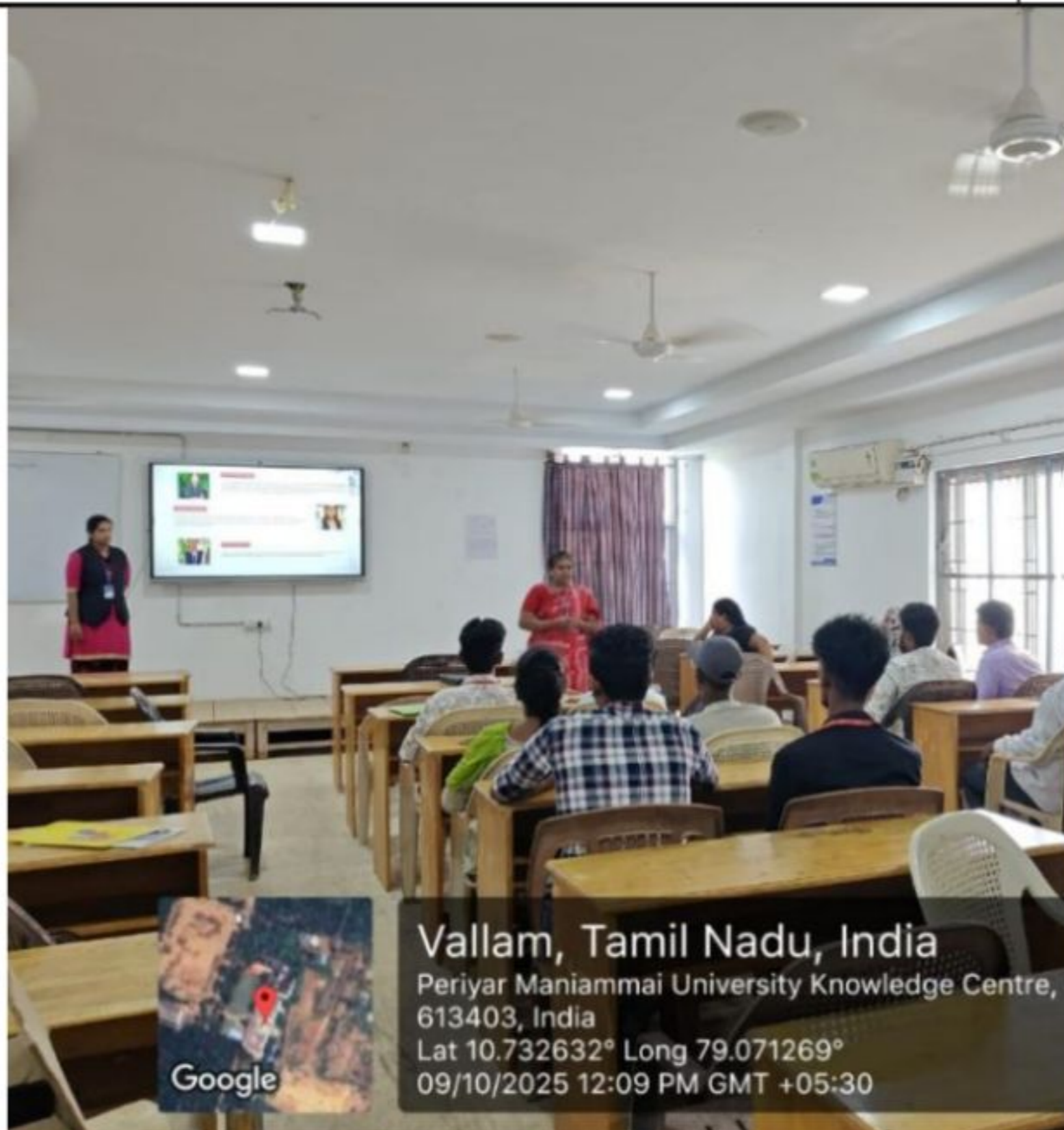
Dr.A. Immaculate Mercy communicate with III - BCA “C, D ” Sections parents.