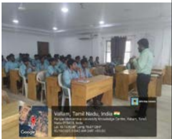
Geotagged Photo with caption