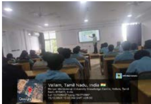
Geotagged Photo with caption