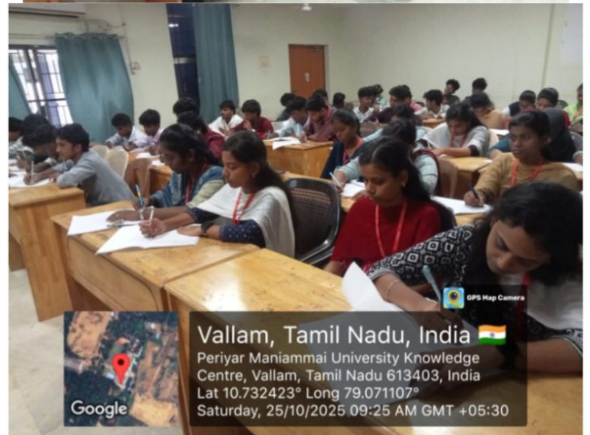
Listening and problem solving practice by students