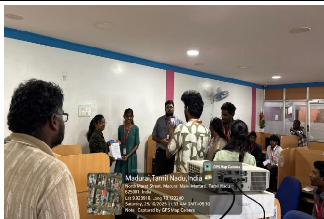
Students Receiving Participation Certificates