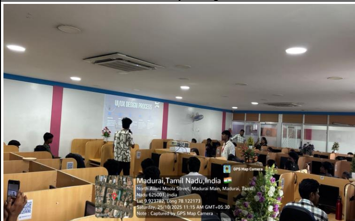
Students Actively Listening Session.