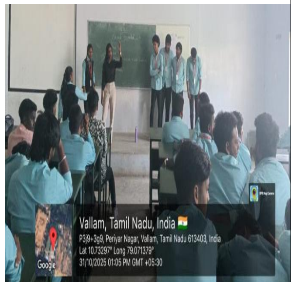
Interaction with the students through activities.