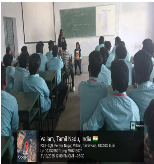
The speaker delivering the session.