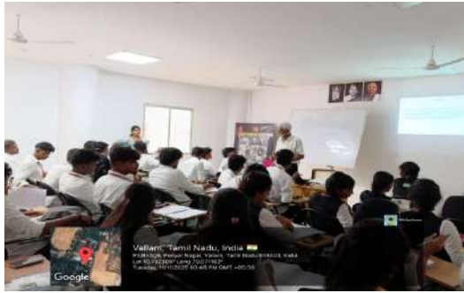
Session-VI: Artificial Neurons