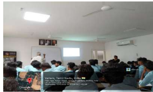
Session-VII: Error detection and solution