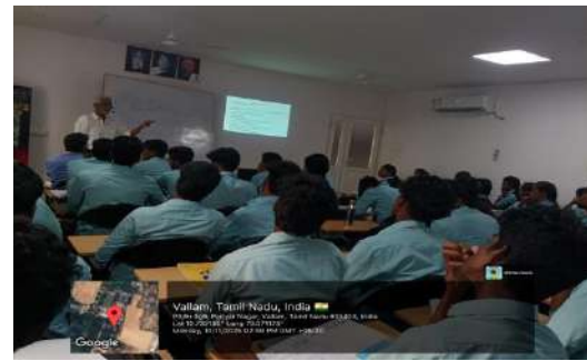
Session-III: Weightage calculation of hidden layers