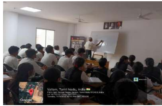
Session-VI: Neural Network with Deep Learning