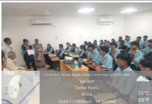
Session-I : Resource Person Introduction

The workshop delivered a clear and beginner-friendly understanding of neural networks. This session fundamentals of neurons, covering both biological and inspiration and artificial neuron modeling. Students are gained the knowledge on how data moves across input, hidden and output layers along with the importance of layer performance and weight influence in the network. Also this workshop introduced simple techniques to evaluate model accuracy, identify errors and understand basic error correction methods. Participants learned the essential structure of a neural network and practiced building and analyzing basic models on the training. Also they learned the step-by-step process of formulating a neural network, analyzing its results and performance metrics effectively.