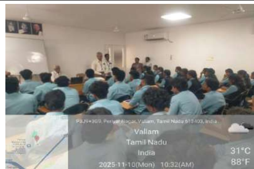
Session-I: Introduction to Neural Networks