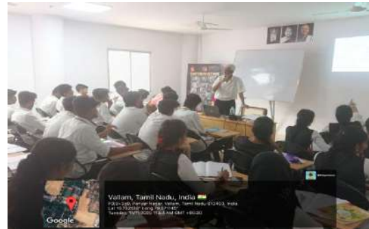
Session-IV: Biological Neurons