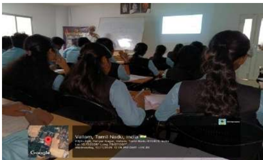
Session-VIII: Interactive Queries Section