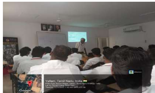
Session-V: Biological Neurons