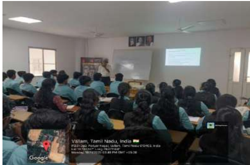
Session-III : Formulation of Hidden Layers