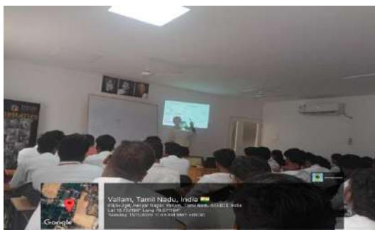
Session-V: Layers Representations