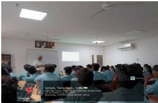
Session-VII: Layers Representations