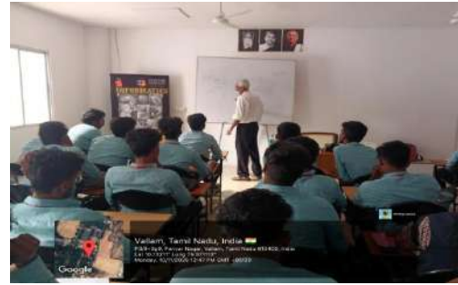
Session-II: Neural Networks Layers