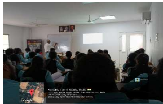
Session-VIII: Discussion and Vote of Thanks