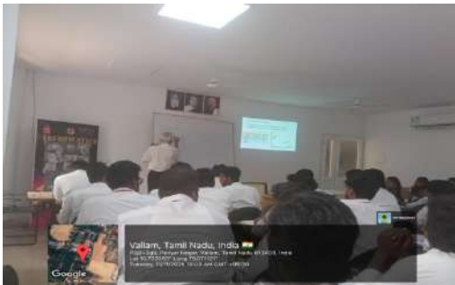
Session-IV: Layers Representations