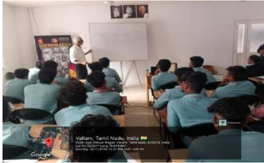
Session-II : Neurons Fundamentals