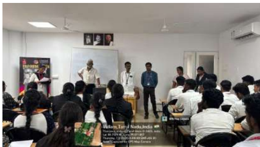
Session-I : Resource Person Introduction

The workshop provided a comprehensive and hands-on introduction to neural networks, beginning with foundational concept of neurons and their role in computational models. Participants explored both biological and artificial neurons, gaining clarity on how information flows through input, hidden and output layers. These session also highlighted how hidden layers functions, how their weightages are influence overall network performance. A significant portion of the workshop focused on measuring errors within neural network models and applying suitable techniques for error correction. Attendees learned the step-by-step process of formulating a neural network, analyzing its results and performance metrics effectively.