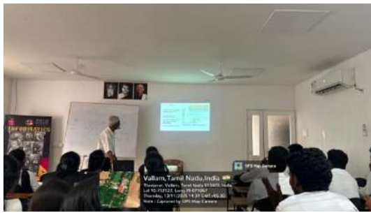
Session-III : Formulation of Hidden Layers