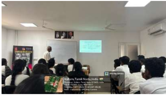
Session-II : Neurons Fundamentals