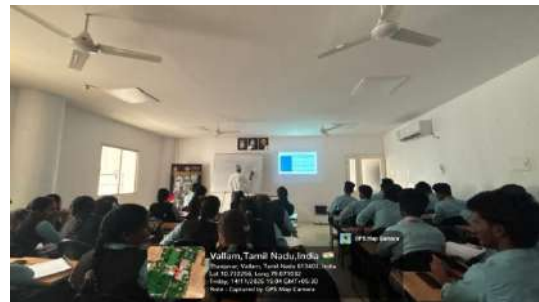
Session-IV: Biological Neurons