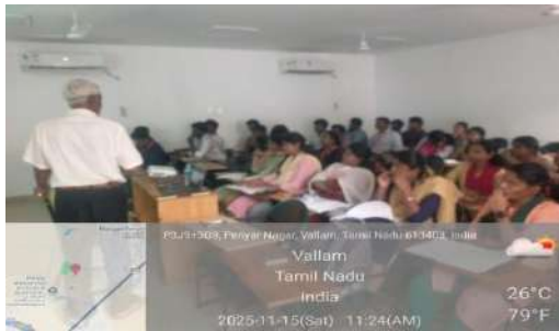
Session-VII: Layers Representations