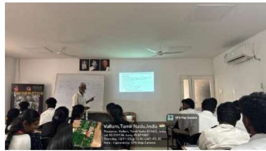
Session-III: Weightage calculation of hidden layers