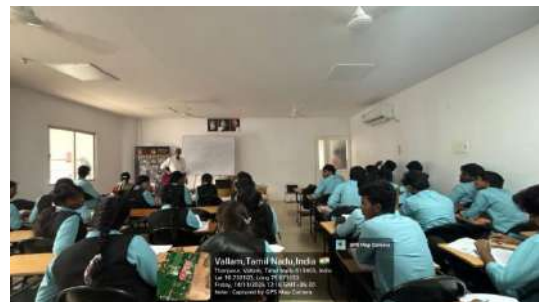
Session-V: Train the Networks with weightage