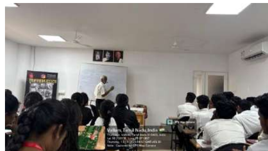
Session-I: Introduction to Neural Networks