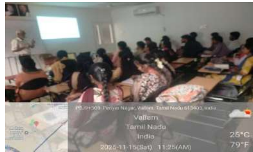
Session-VII: Error detection and solution