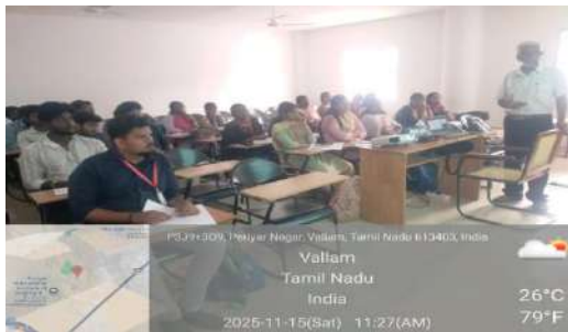
Session-VIII: Interactive Queries Section