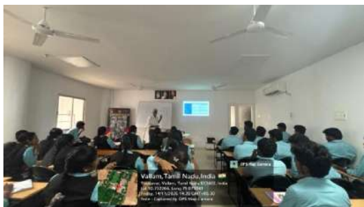
Session-V: Artificial Neurons