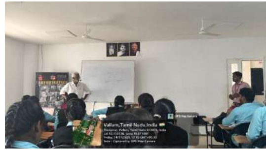
Session-VI: Neural Network with Deep Learning