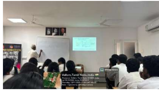
Session-I: Neural Networks Layers