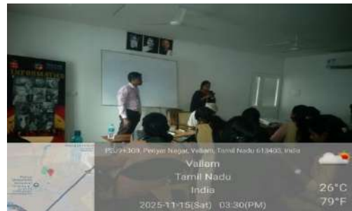
Session-VIII: Discussion and Vote of Thanks