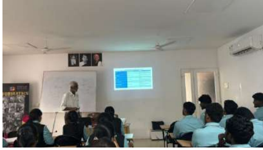
Session-VI: Artificial Neurons