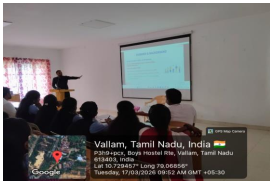
Pre Placement Talk by the HR

The on-campus drive had been organized for 2026 pass-out students from streams including B.Sc, M.Sc, BBA, MBA, BCA, and MCA. It had been conducted on 17th March 2026 at 09:30 AM in the B.Ed Seminar Hall (A/C), PMIST. The recruitment process had included a Pre-Placement Talk followed by an Online Aptitude Test. A total of 163 students had attended the online assessment, out of which 17 students had been placed. The selected candidates had been offered the role of Project Trainee in Tiruchirappalli.