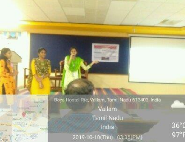
External Participants Presented their research outcome at BIONICS'19