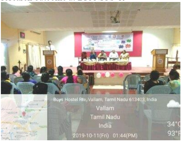
Validation of BIONICS'19