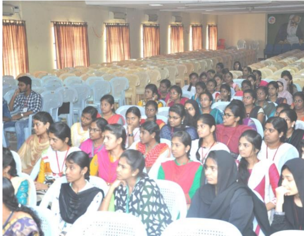
Participants of the workshop