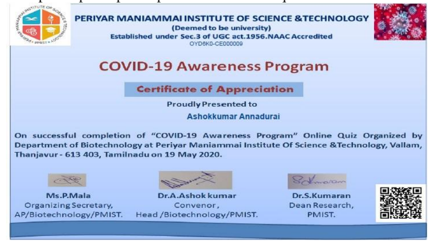
Certificate issued to the registered participants