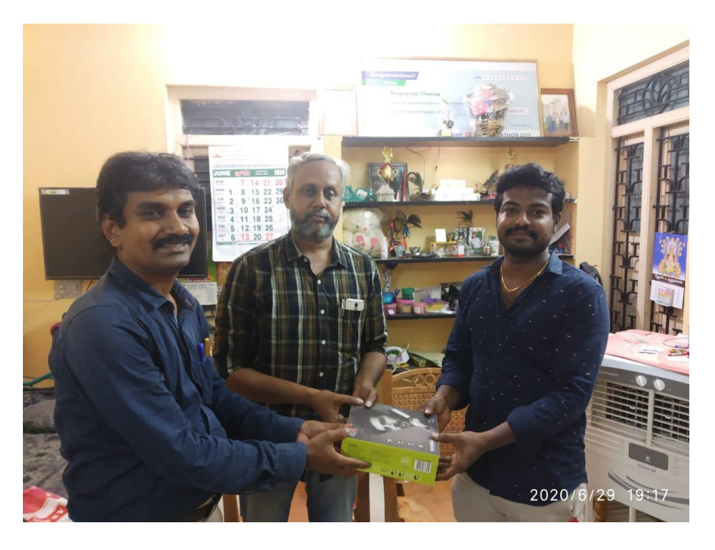
Honoring the resource person with memento