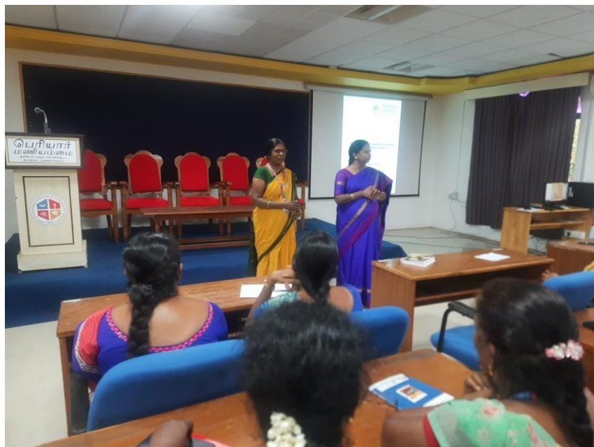
Participant sharing her views during the PDP