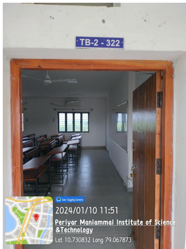
TB-II – 322 Lecture Hall