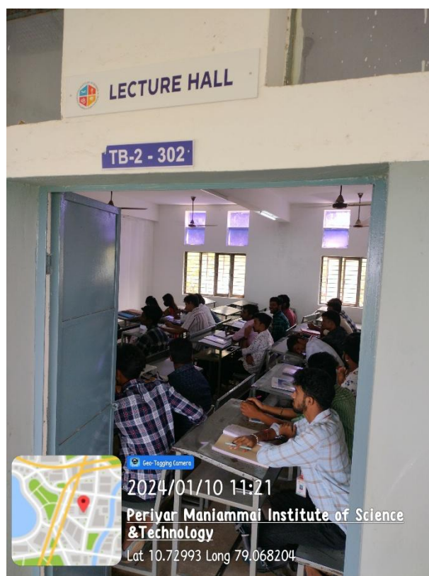
TB-II – 302 Lecture Hall