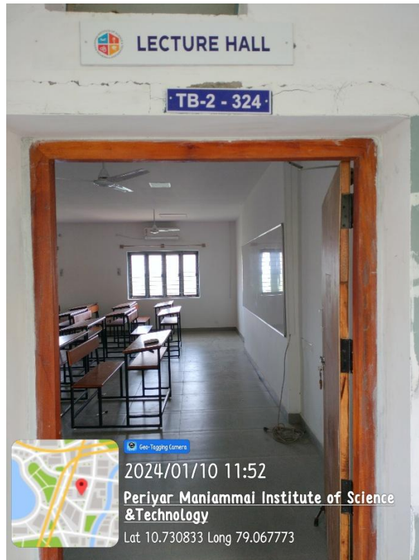
TB-II – 324 Lecture Hall