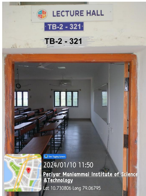
TB-II – 321 Lecture Hall