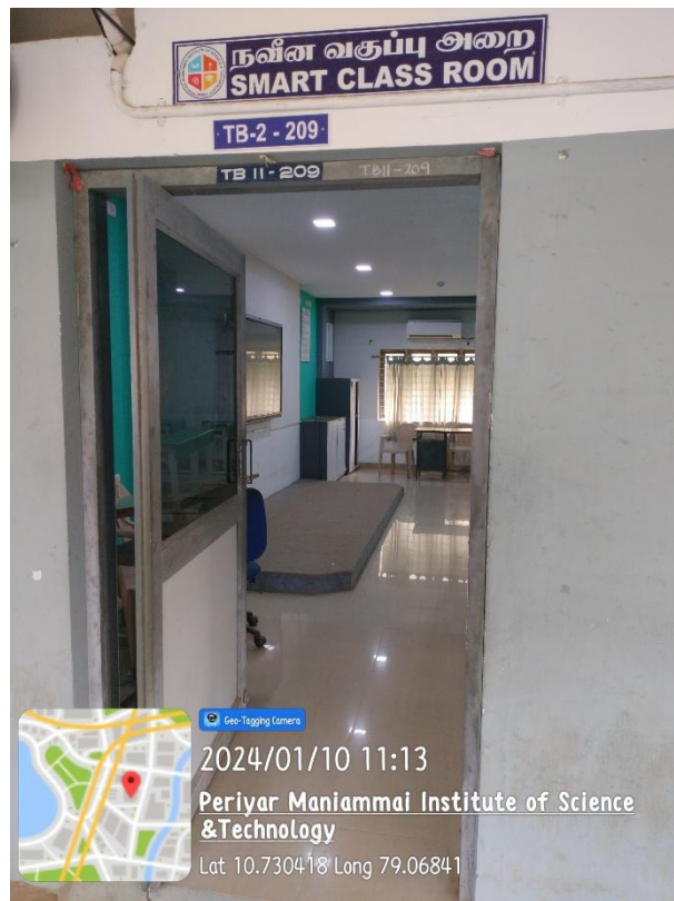
TB-II – 209 Smart Class