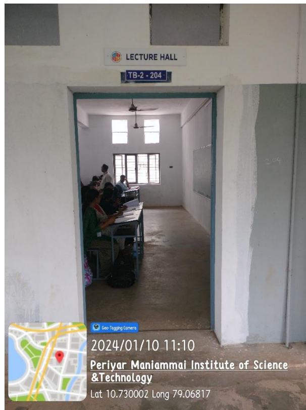
TB-II – 204 Lecture Hall