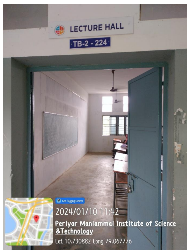
TB-II-224 Lecture Hall