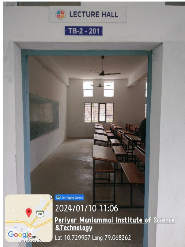
TB-II – 201 Lecture Hall