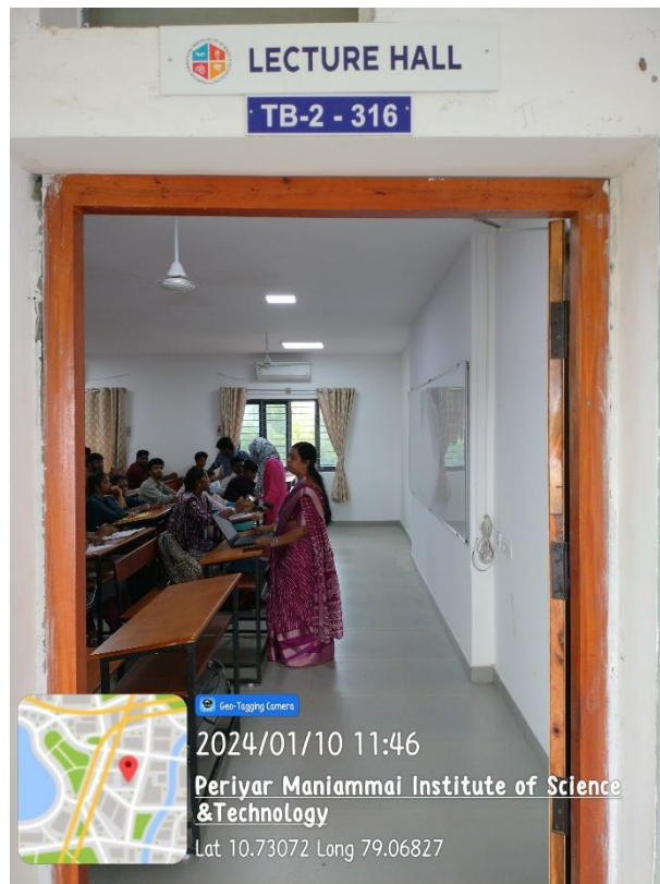
TB-II – 316 Lecture Hall