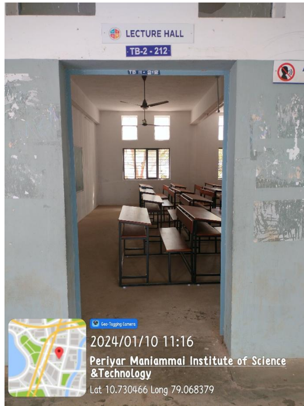
TB-II – 212 Lecture Hall