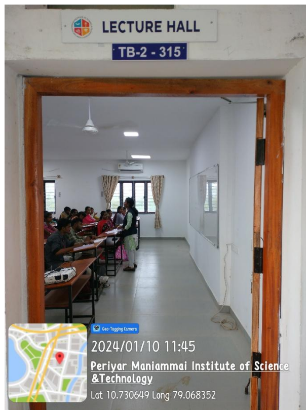
TB-II – 315 Lecture Hall