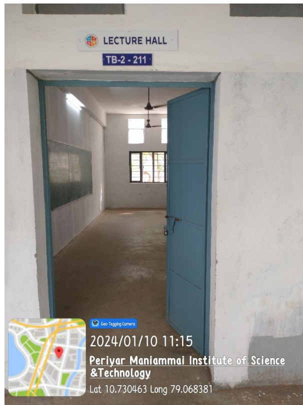
TB-II – 211 Lecture Hall