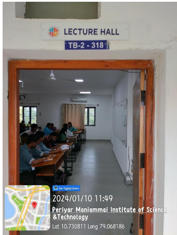
TB-II – 318 Lecture Hall