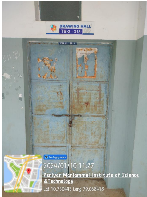
TB-II – 313 Drawing Hall