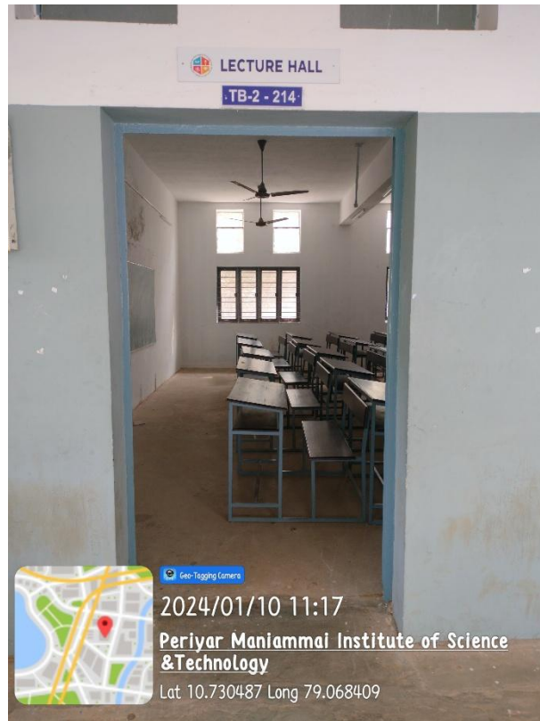
TB-II – 214 Lecture Hall