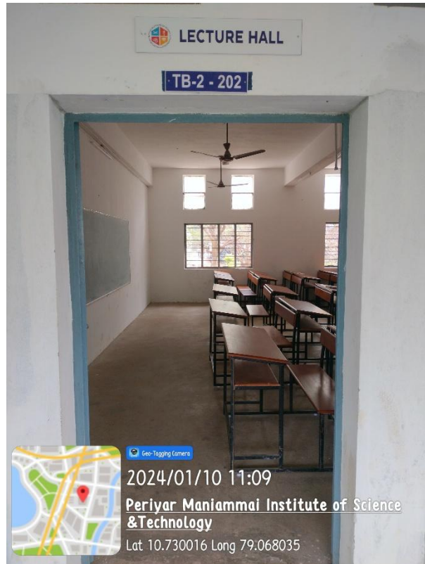
TB-II – 202 Lecture Hall