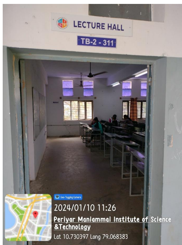
TB-II – 311 Lecture Hall