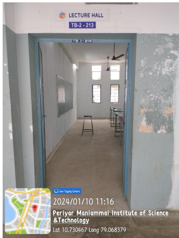
TB-II – 213 Lecture Hall