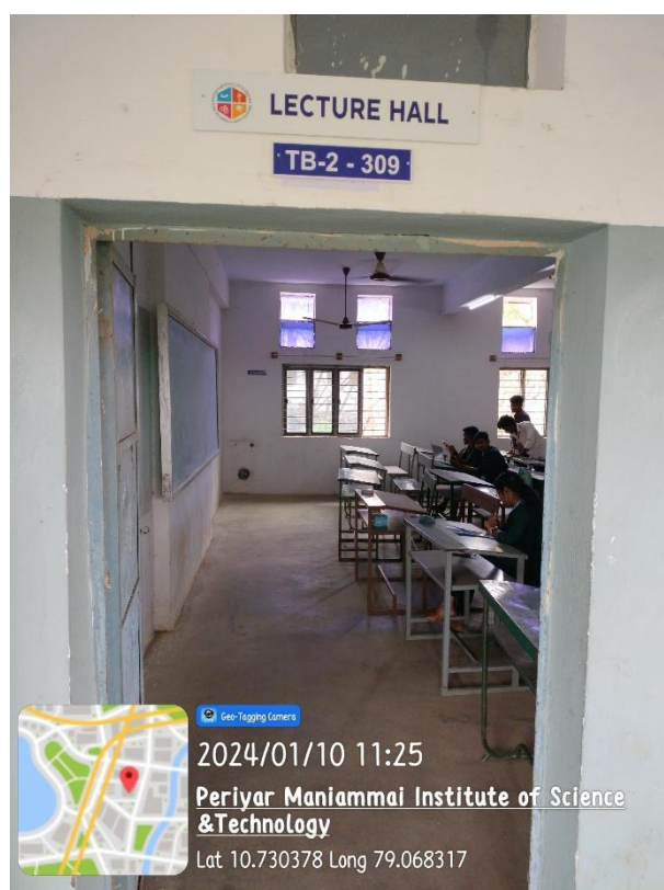
TB-II – 309 Lecture Hall