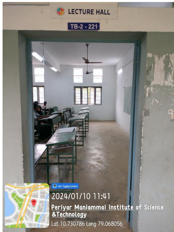
TB-II – 221 Lecture Hall