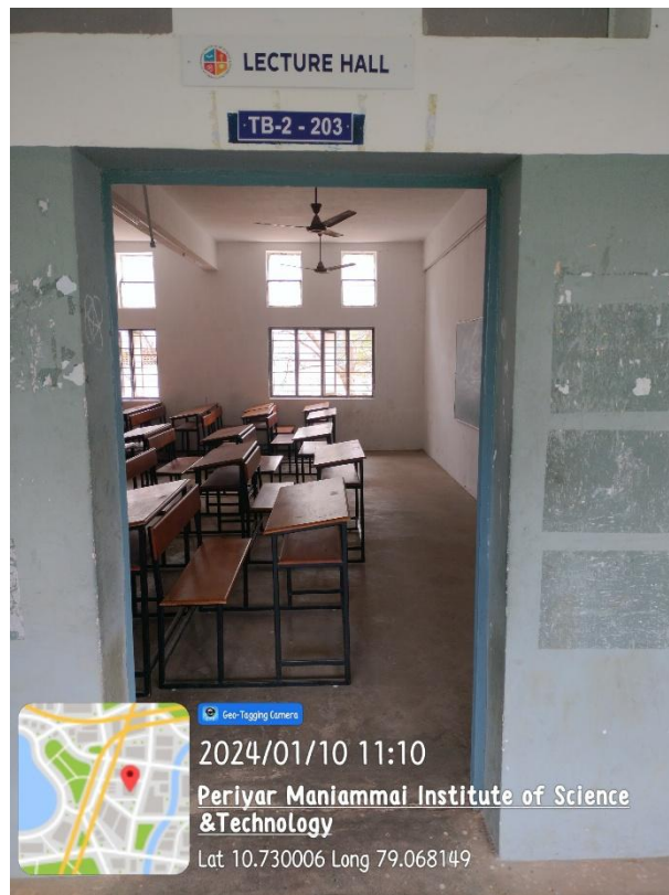
TB-II – 203 Lecture Hall