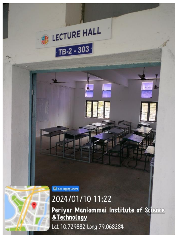
TB-II – 303 Lecture Hall