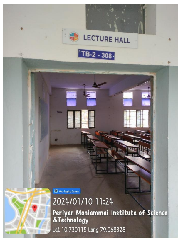
TB-II – 308 Lecture Hall