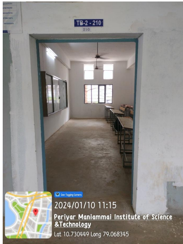
TB-II – 210 Lecture Hall