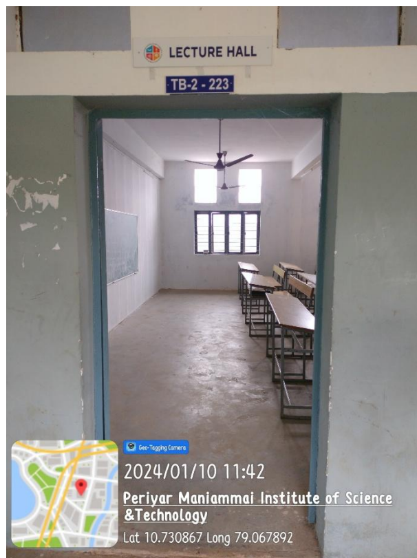
TB-II-223 Lecture Hall