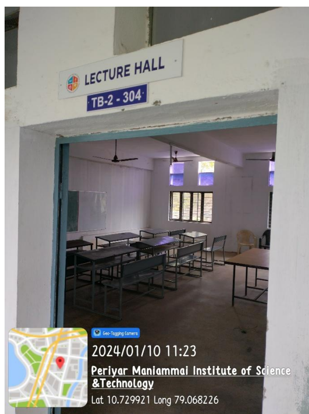
TB-II – 305 Lecture Hall