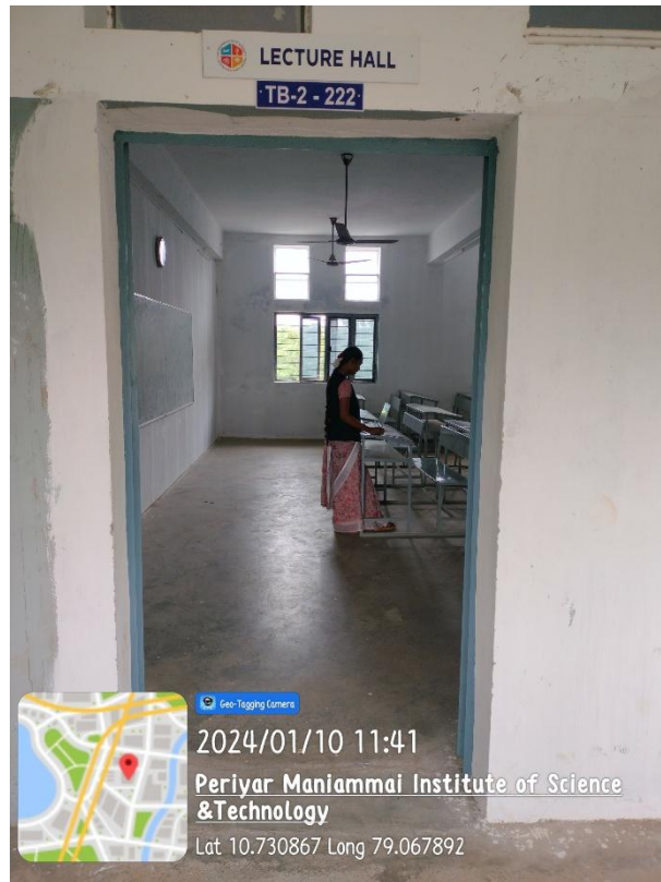
TB-II – 222 Lecture Hall