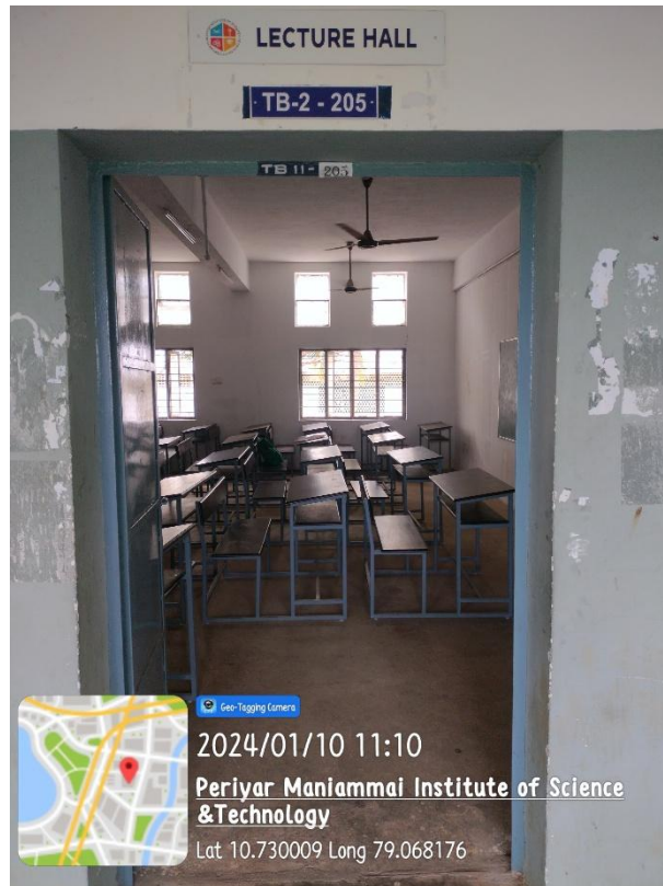
TB-II – 205 Lecture Hall