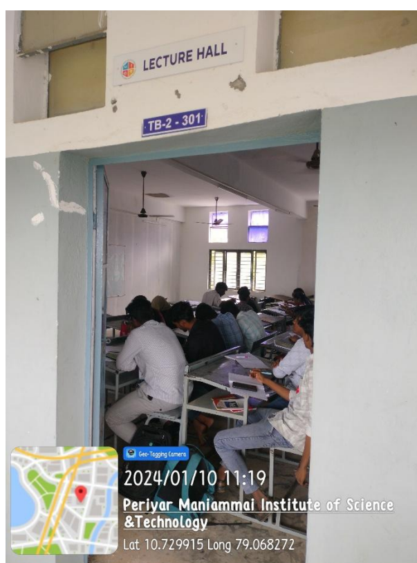
TB-II – 301 Lecture Hall