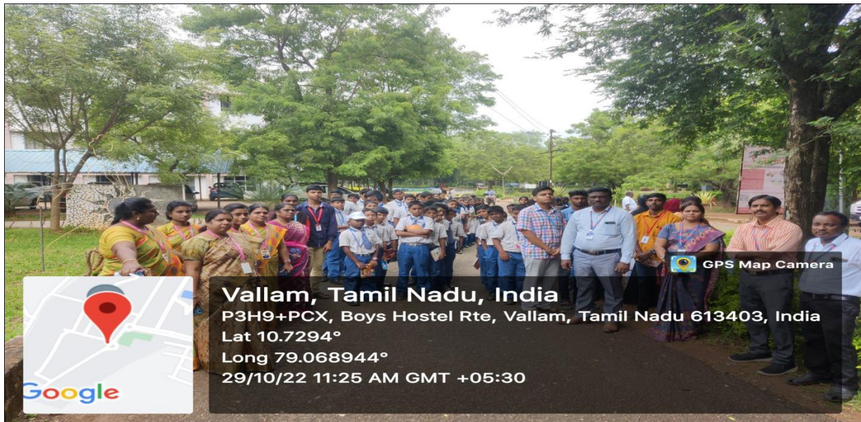
(SBA Matriculation Higher Secondary School Students, Mannargudi in Participative learning)