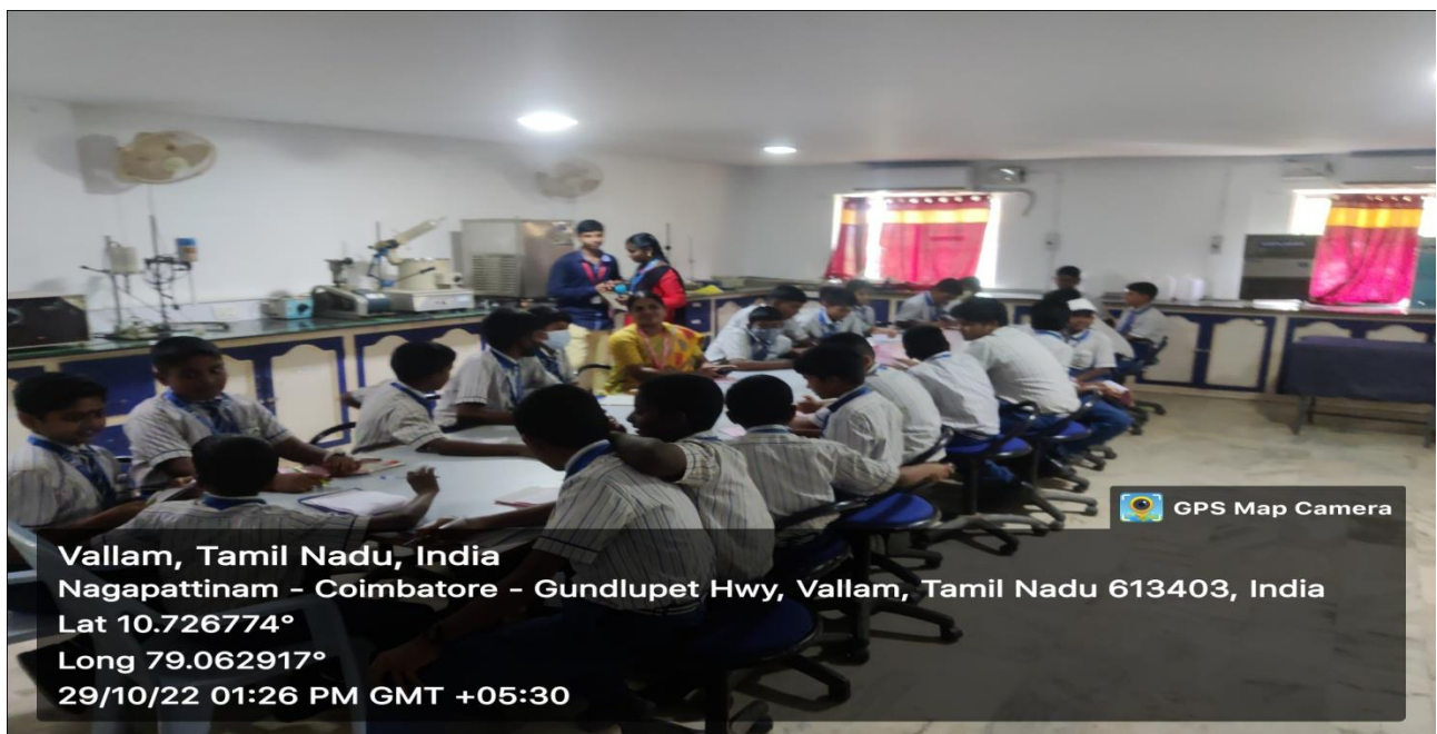
(Students of SBA School Actively learned about Micro organisms like Bacteria and Fungal growth explained by the Faculty of Bio Technology)